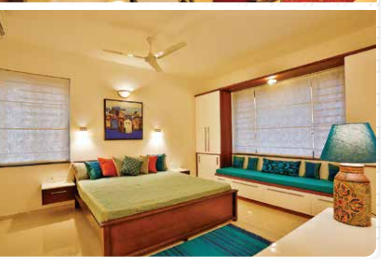
*Actual images of PPD MB Urbanville